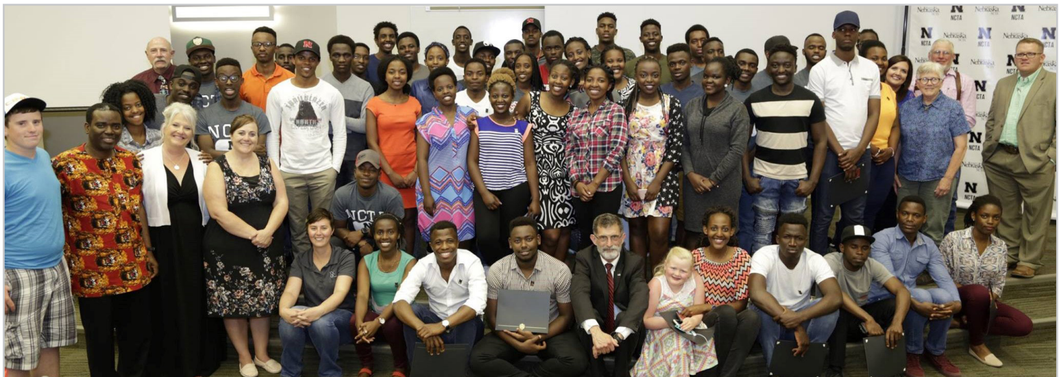
Community support for the UNL CUSP scholars was evident at the completion ceremony on May 31 at the NCTA Education Center.