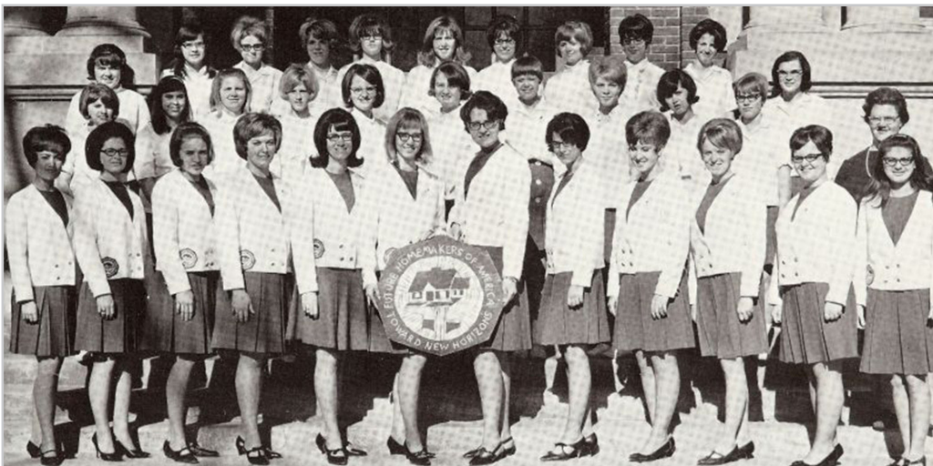
In 1967-68, Future Homemakers of America (FHA) was one of the largest campus clubs for young women at the University of Nebraska School of Agriculture.

Other high school memories: girls wore dresses, not slacks, and they did not have sports. Boys competed in football and basketball. Student clubs sponsored dances and social activities, much like the college clubs do today. The Aggies also hosted a Jr. Ak-Sar-Ben, and girls could show the livestock provided by the boys. Immense school pride existed, as is evidenced by the 1968 year-book.